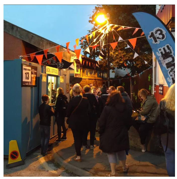
Evening Line-up outside Venue 13 in 2019

Its return in 2025 not only marks a new chapter but reinforces its legacy in the world's largest arts festival. The Edinburgh Fringe has faced significant challenges in recent years, highlighted by the recent announcement from organisers of the financial troubles at Summerhall (Venue 26). With box office money withheld from artists and companies due to the risk of liquidation, the uncertainty surrounding one of the Fringe's key venues is a stark reminder of the pressures the festival faces.