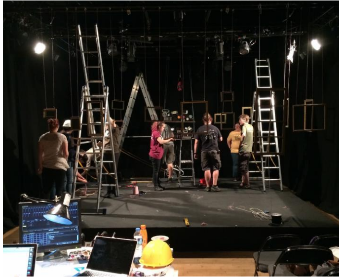
Load in of Venue 13 2014

Venue 13 stands ready to bring much-needed optimism to this climate of uncertainty. By revitalising this cherished venue, Venue 13 aims to foster stability, creativity, and community for both artists and audiences, delivering the good news that the Fringe community so desperately needs.